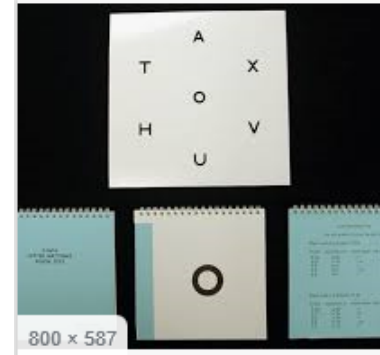
2. Visual Acuity